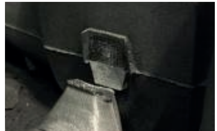
Sider riser mit NETFrame® after knock off