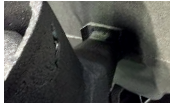
Side riser with NETFrame® after shake out

The riser was able to be removed by traditional mechanical methods (wedger) without the need for cutting. It was not necessary to remove the casting to a separate work area resulting in a significant reduction in the amount of labour involved in removing riser residues by 11 Minutes per casting. In addition it was possible to eliminate the risk for breaking in and a significant reduction in the overall casting rejection rate was achieved.