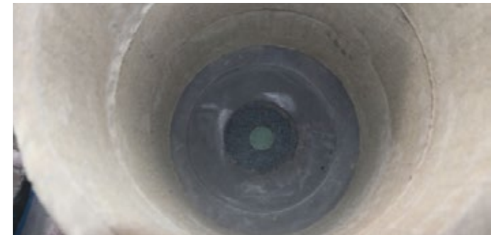
NETCore® before molding

By using NETCore® technology, the casting can be produced in the regular process and enables the foundry to reduce the machining time by 300 minutes per casting. The contact residue can be removed by mechanical means (light grinding). In addition, the risk of rejects due to break-in is eliminated.