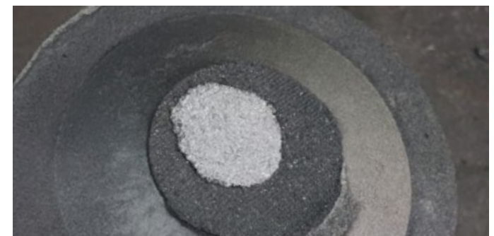
NETCore® riser contact