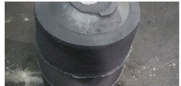
NETCore® after knocking off